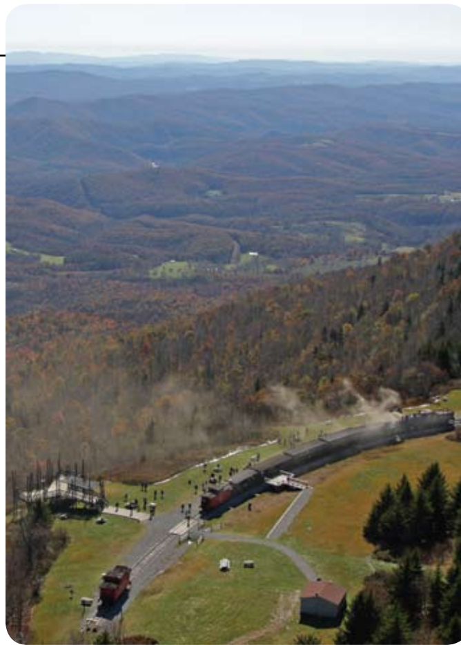
Walter Scriptunas II

A complete special events list is online at www.cassrailroad.com .